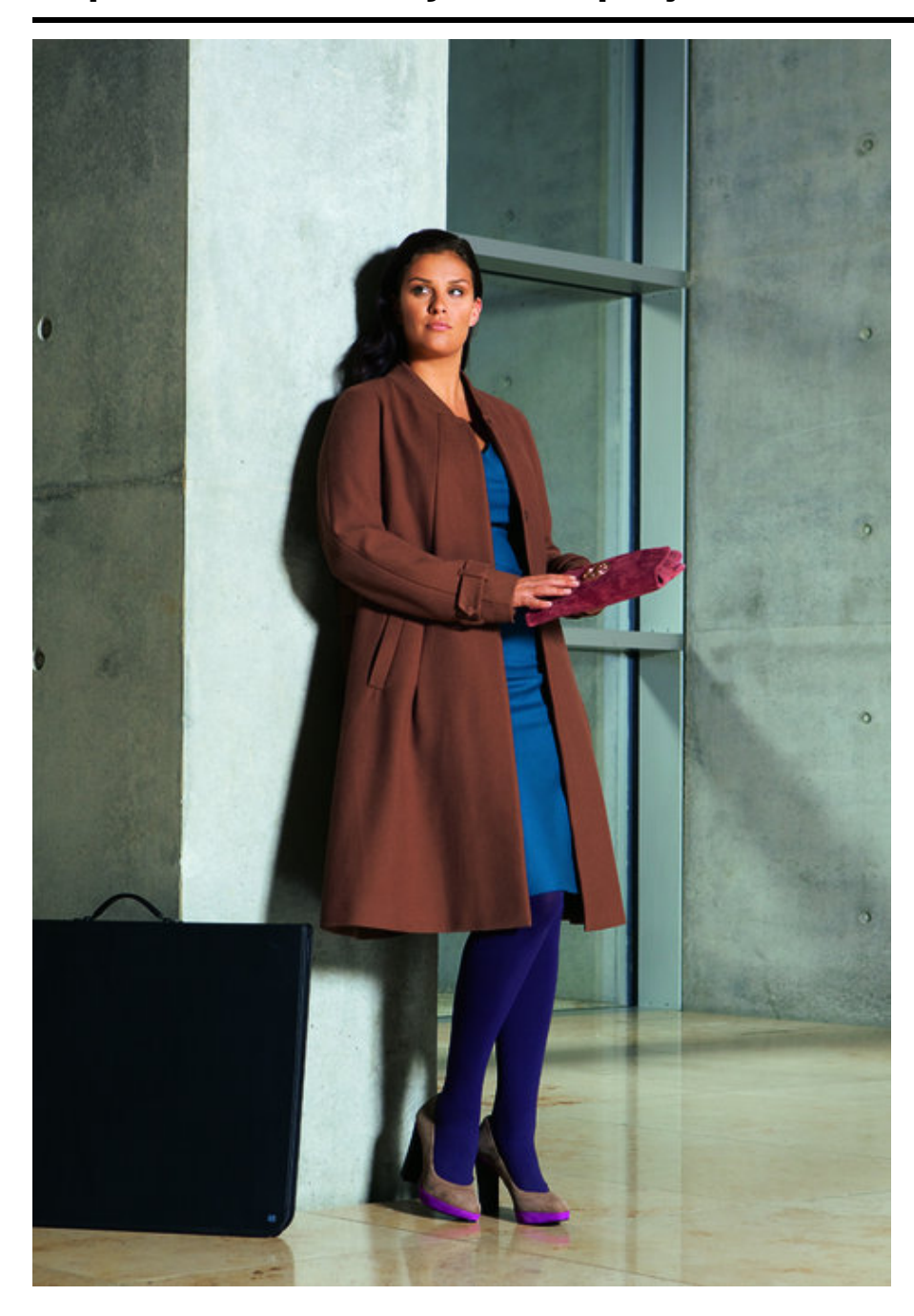
Long coat burda style magazine patterns FAQ

http://www.burdastyle.com/projects/102011-plus-size-long-a-line-co