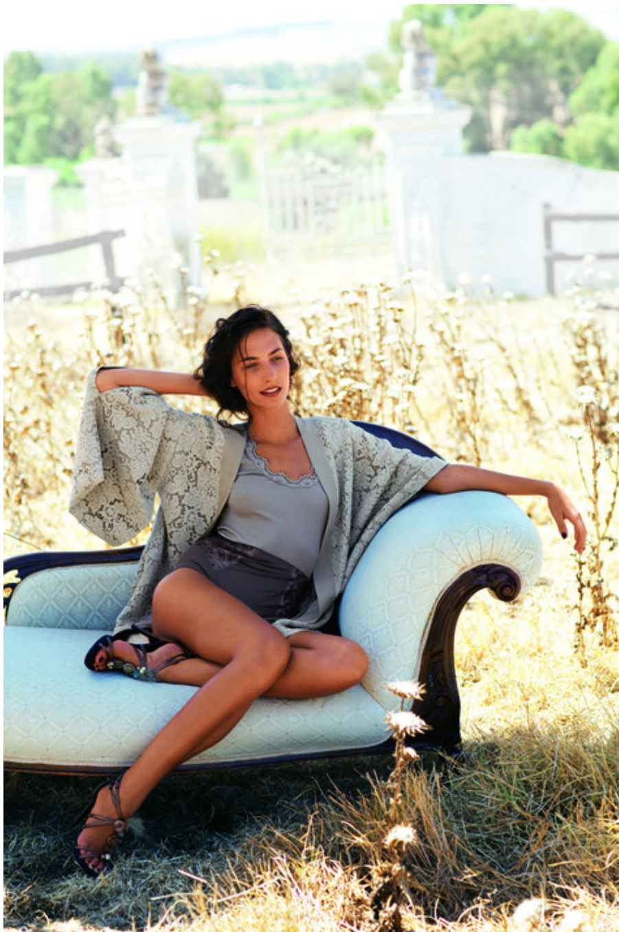
Lace Kimono burda style magazine patterns FAQ

http://www.burdastyle.com/projects/072011-lace-kimono