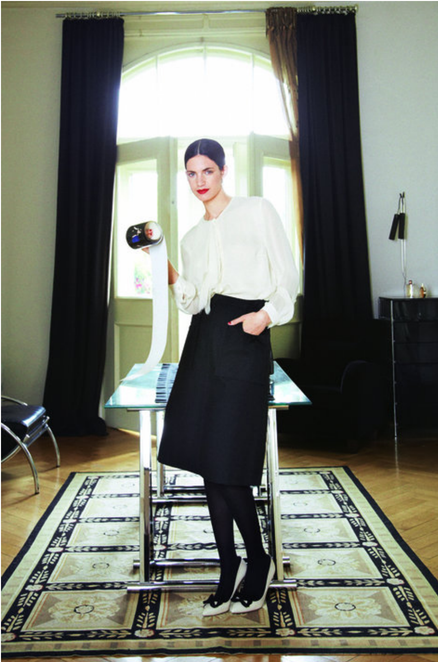
Blouse with jabot burda style magazine patterns FAQ

http://www.burdastyle.com/projects/102011-blouse-with-jabot