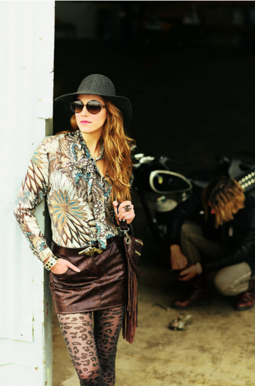
Leather skirt burda style magazine patterns FAQ

http://www.burdastyle.com/projects/102011-leather-skirt