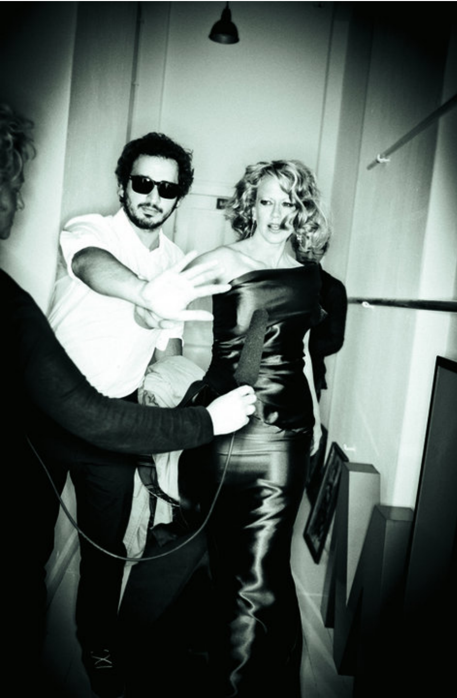
One shoulder evening gown burda style magazine patterns FAQ

http://www.burdastyle.com/projects/112011-single-shoulder-evening-gown