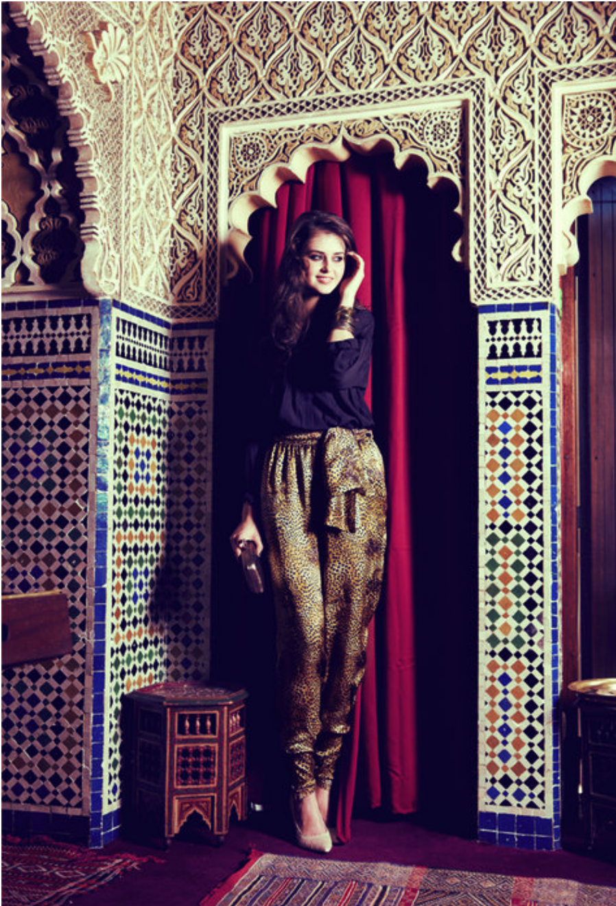
Leopard print pants burda style magazine patterns FAQ

http://www.burdastyle.com/projects/112011-leopard-print-pants