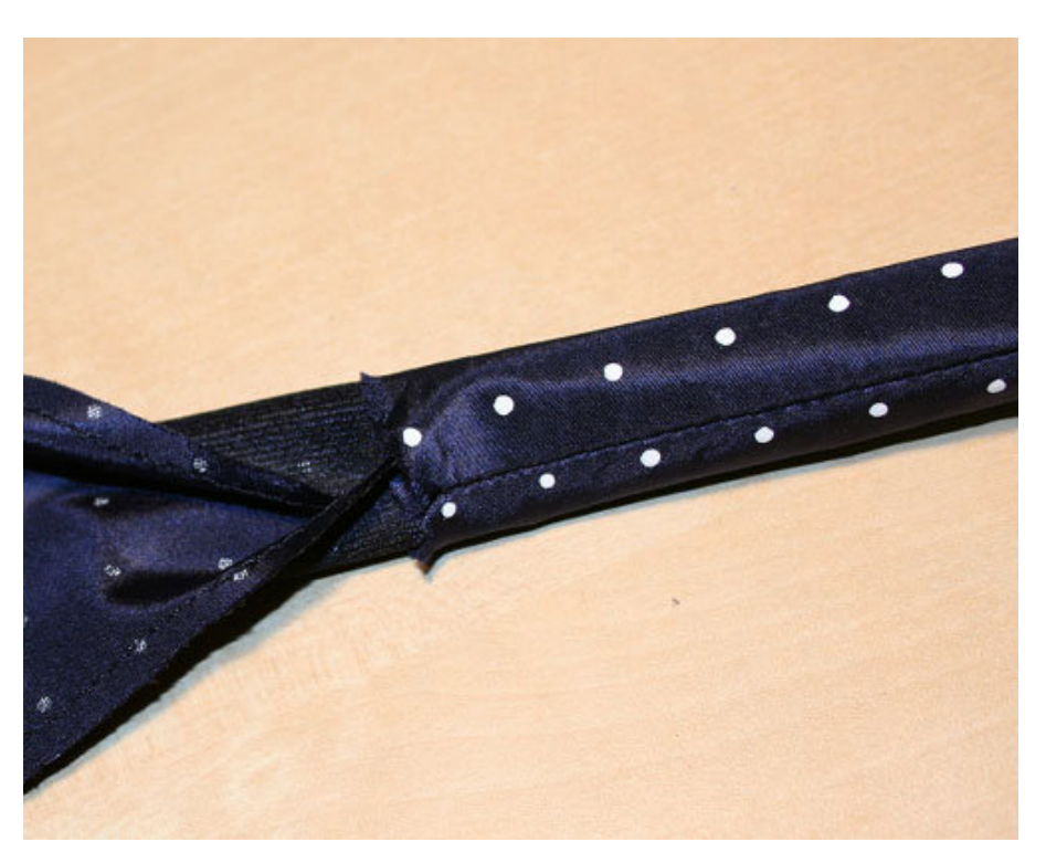
TURN. Now, pull the bow-tie right side out, either using your nimble fingers and patience, or the thread/points trick (see related techniques).