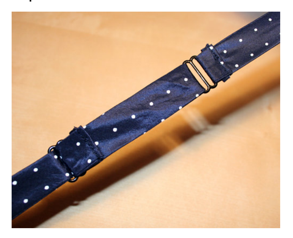
For piece B, again make sure the non-interfaced side is up. Feed the tail down and through the open slot of the second slider. Neaten the raw edge, fold narrowly, fold again, and stitch the loose end.