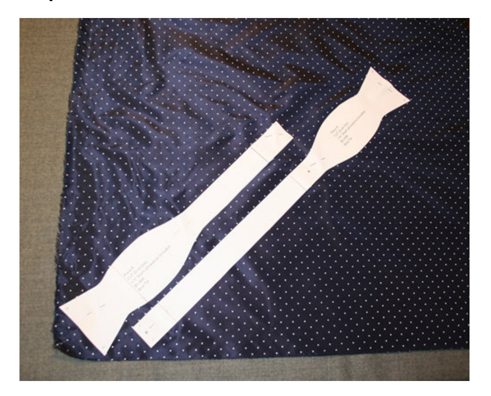
CUT AND PREPARE. Cut out 2 each of pieces A and B, on the bias. Interface one each. For the second piece A, interface the long skinny strip between the \hat{a} ' * \hat{a} ' marks.