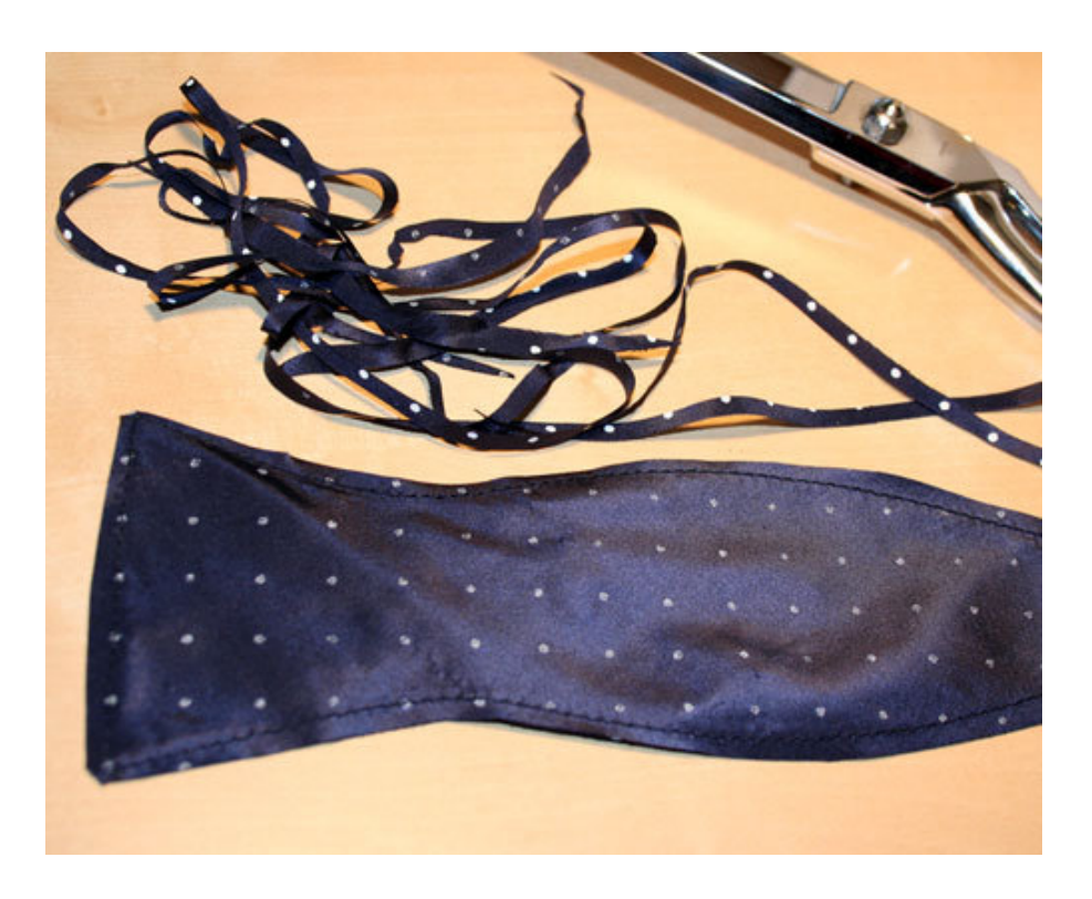
TRIM the seam allowances to 1/8â' all around.