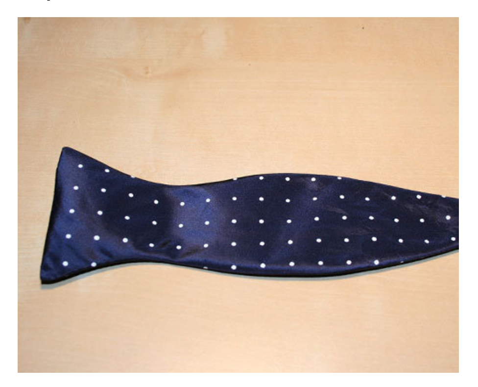
PRESS. Shape the corners and flatten the edges of the tie before pressing with an iron.