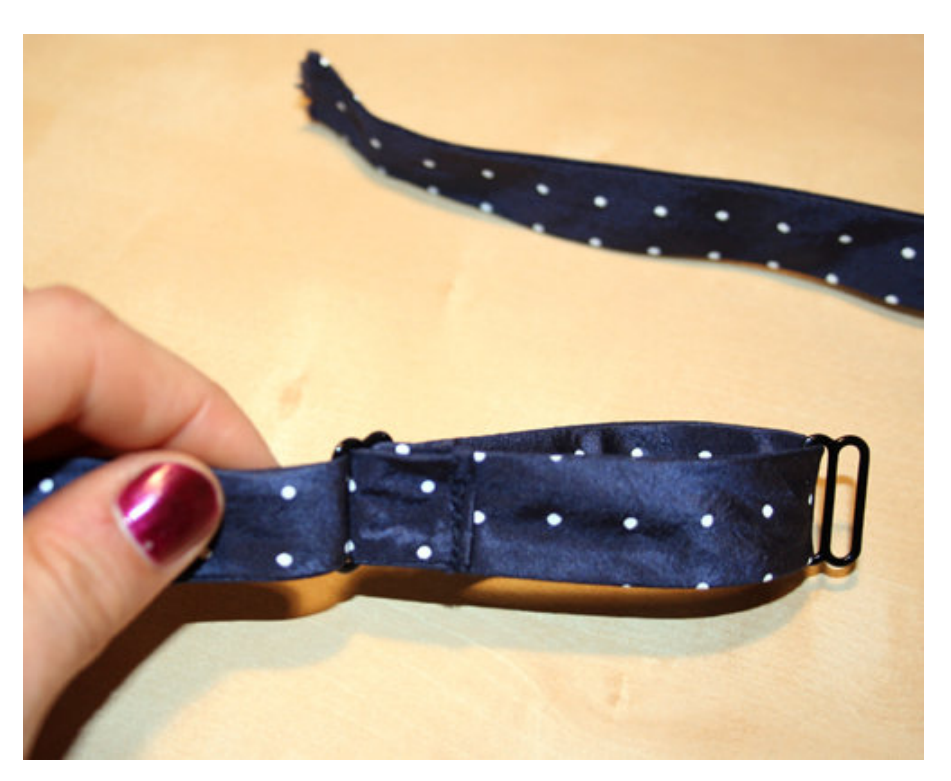
STITCH. Neaten the raw edge, fold narrowly, fold again, and stitch the loose end to the tail between the two sliders.