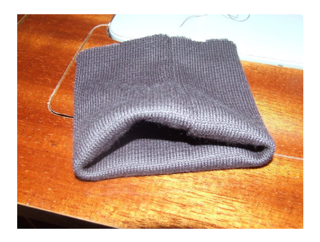
Step 3 — Fold the cuff...

...on half and even it nicely. Fold it so that right side is outside, like it is on this photo