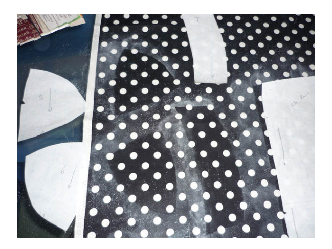
Step 1. Layout your slippery fabric on a large table as straight as you possibly can. <BR><BR> <BR> Step 2. Place your pattern piece on top and then just use a couple of weights to hold it in place. Tuna cans, cups, anything will do. You will only need a couple for each piece. <BR> Step 3. Dab your chalk ball all the way around the pattern piece while holding the edges down. This is so fast compared to pinning your pattern down. It will take just seconds. <BR> Step 4. Remove the patterns and you can see a perfect outline of your pattern. Even if you shift or wiggle the fabric while you are cutting the exact imprint will stay the same. Cut and you will have a perfect replica of your pattern. <BR> SR> Any chalk remnants will have brushed off by the time you've finished your sewing. (For the picture I used a cotton fabric to make it more visible.)