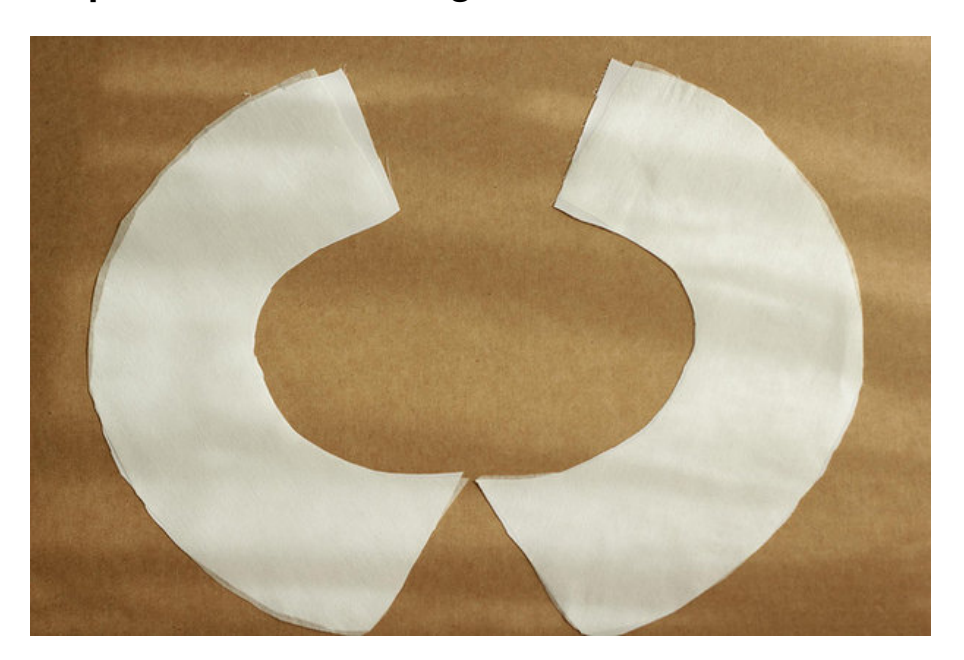
Step 3 — Iron Interfacing to Pieces

iron the interfacing on to 2 pieces of the main fabric. the pieces with interfacing will be your â' upper collarâ' (the part of the collar that is on top).