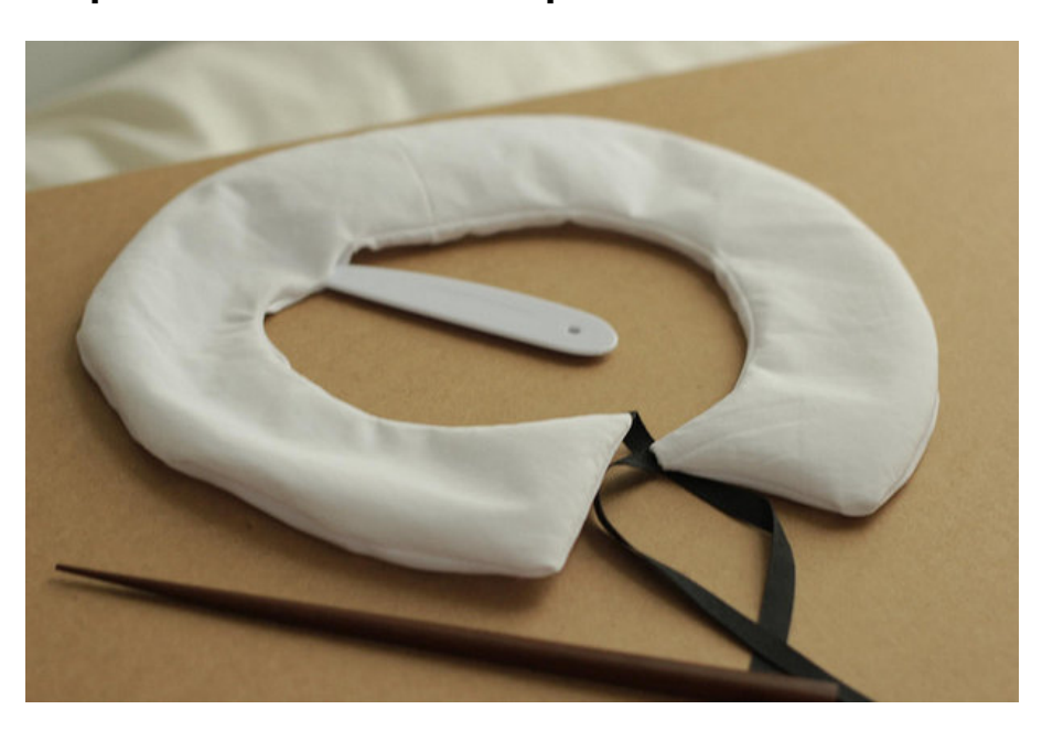
Step 10 — Turn collar and press

turn your collar right side out (through the hole) and use something sharp (a seam opener if you have one, otherwise a chopstick works great) to go all along the edges and especially corners to make sure itâ's completely turned out all of the way. press flat.