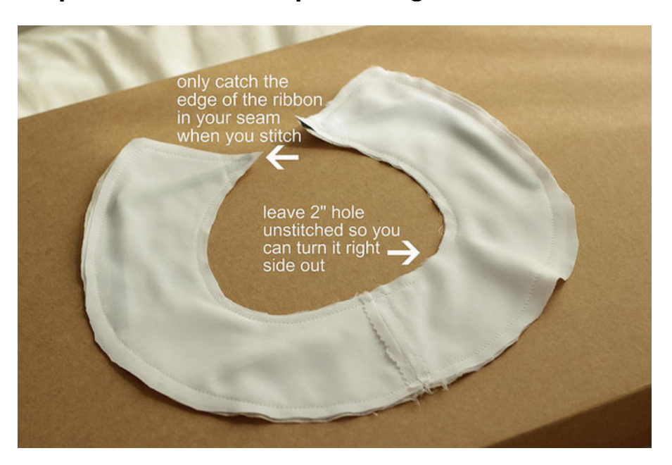
Step 7 — Stitch collar pieces together

stitch all around the edges of the collar with a 1/4â' seam allowance. make sure to leave a gap of about 2â' to turn.