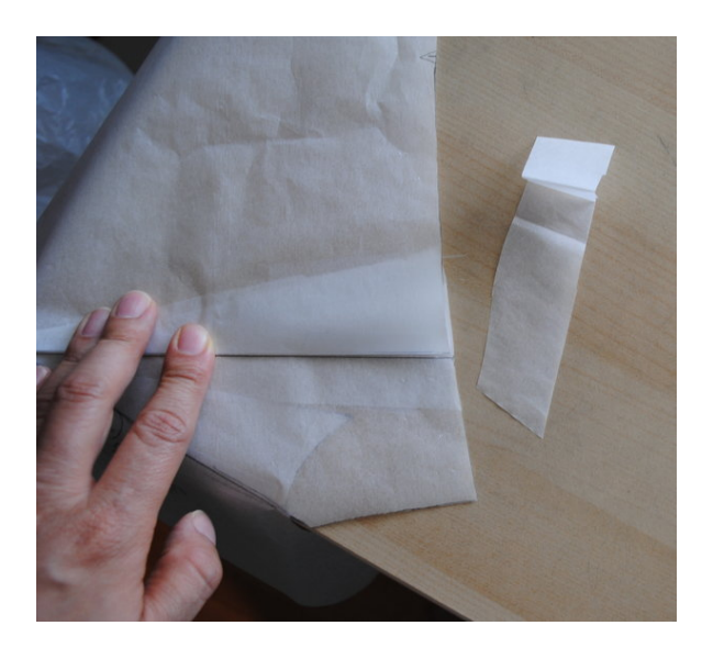
Step 11 — Trim the extra paper off.

Fold the dart closed the same way you would if you were sewing it. (I do this over the corner of a table not to smoosh anything. Trim the extra paper away by following the side seams.