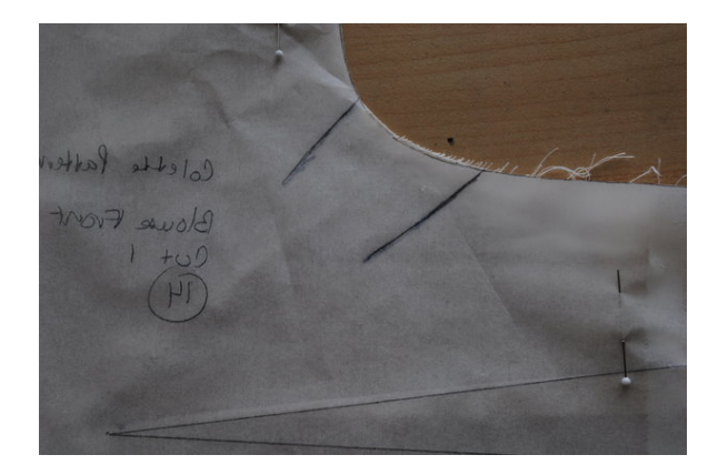
Step 5 — Copy marks onto pattern.

Place the paper pattern onto the muslin and copy the marks on the paper.