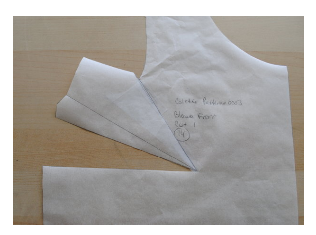
Step 9 — Close the armhole dart.

Close the armhole dart by shifting the lower leg to rest on top of the upper leg. Tape it down. The bust dart will now be bigger.