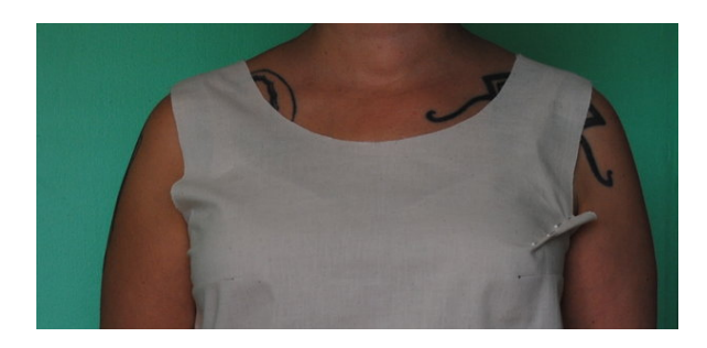
Step 2 — Create an armhole dart.

If you have never made up your pattern before, it is important to make a muslin before you do. I made a muslin for this top and noticed that there was a lot of gaping in the armhole. This is common for women with full busts and can cause a lot of frustration.