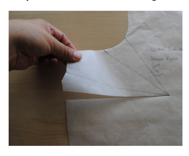
Step 7 — Cut the bottom leg of the bust dart.

Draw in the armhole dart by using the marks as the end of the dart legs. Have the dart end at the same point that the bust dart ends.