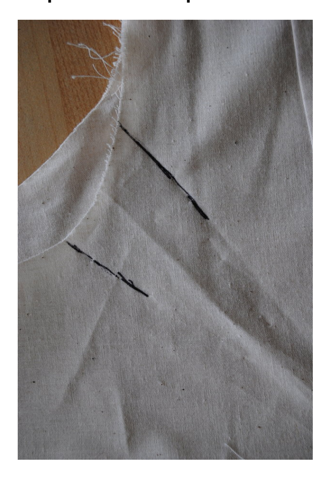
Step 4 — Take the pins out.

Take the pins out, remove the side seam, and press.