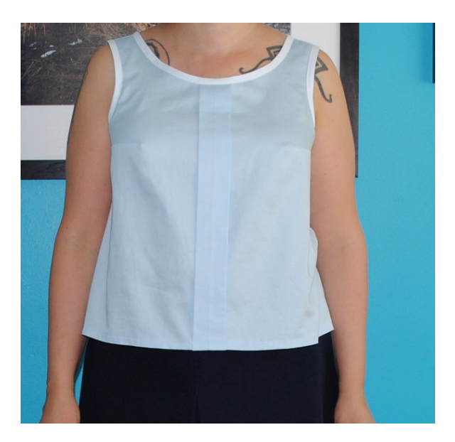
Step 16 — No more gaping armhole!

Now you have a new front bodice pattern piece. I usually make another muslin to make sure that I took out the right amount and to make sure the new armhole works ok. Sometimes it needs a little more work to make sure it is the right shape.