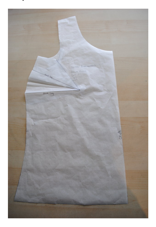
Step 15 — Make another muslin.

Now you have a new front bodice pattern piece. I usually make another muslin to make sure that I took out the right amount and to make sure the new armhole works ok. Sometimes it needs a little more work to make sure it is the right shape.