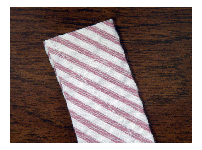
Step 5 — Trim

Cut off the top of the funnel to the first stitch.