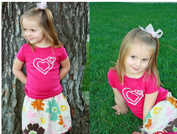
Shirt in Action