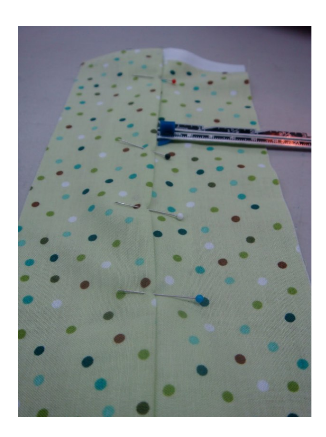
Pin the left hand seam over the right hand seam, overlapping by 1/8". Make sure to catch your zipper in the pins.