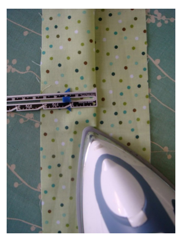
Step 2 — Measure and Press