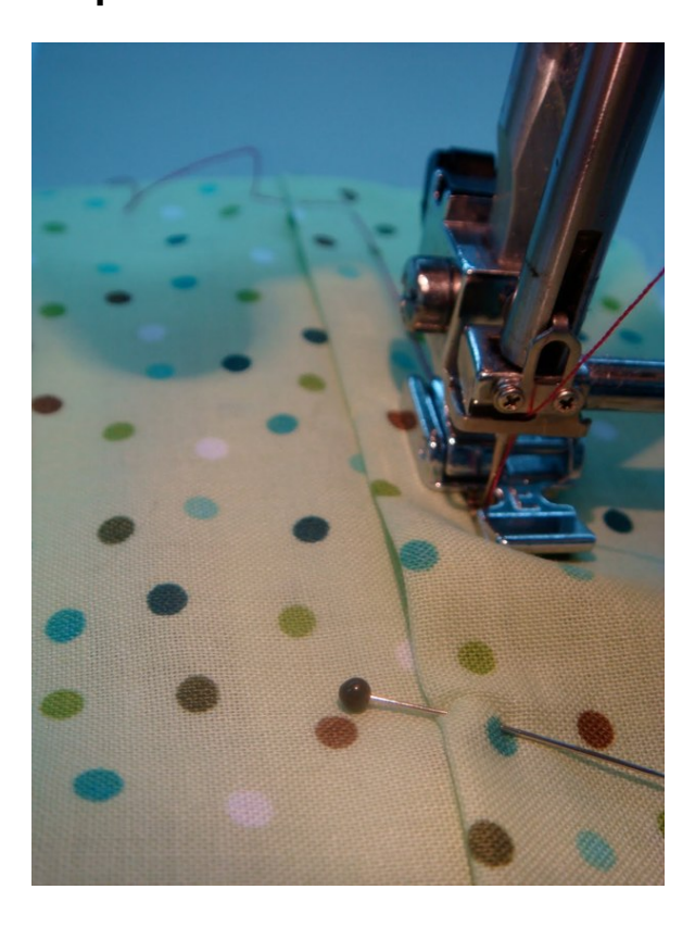
Step 6 — Pin lap in place over zipper