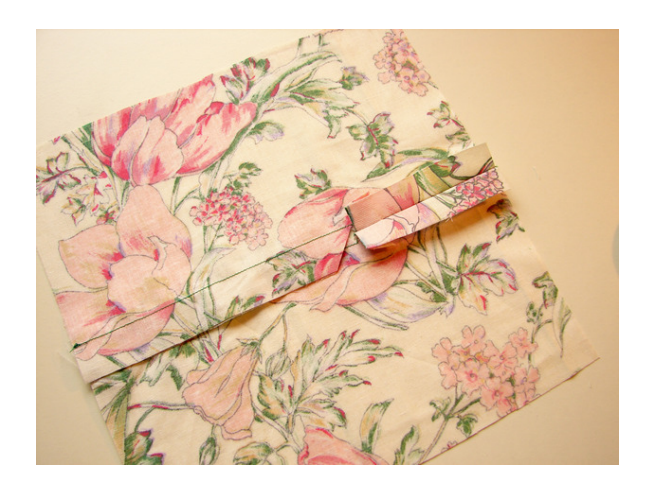
Step 6 — Press the seam allowances open

Press open the seam allowances below the zipper opening.