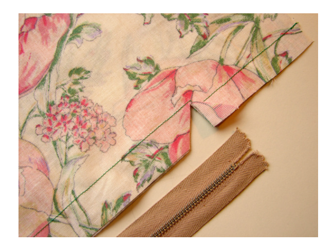
Step 5 — Press the triangles to the seam allowances below the zipper

Fold and press the triangles along the staystitching to the wrong side of the seam allowances below the zipper.