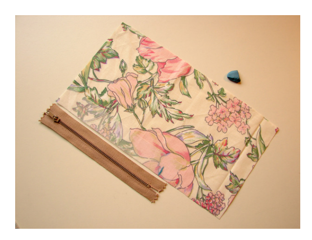
Iron 2.5 cm wide fusible interfacing to the right side of both zipper seam allowances. The interfacing should be 0.5 cm shorter than the full length of the zipper. Mark a line, where the zipper ends.