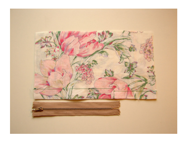
Step 3 — Stitch the seam below the zipper

With the right sides together, stitch the seam below the zipper opening, 1.5 cm wide.