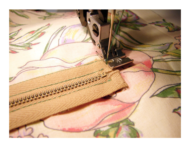
Step 11 — Edgestitch the zipper

Edgestitch the zipper in place from top to bottom on one side, sew across the zipper base to secure, and edgestitch from bottom to the top on the other side of the zipper.