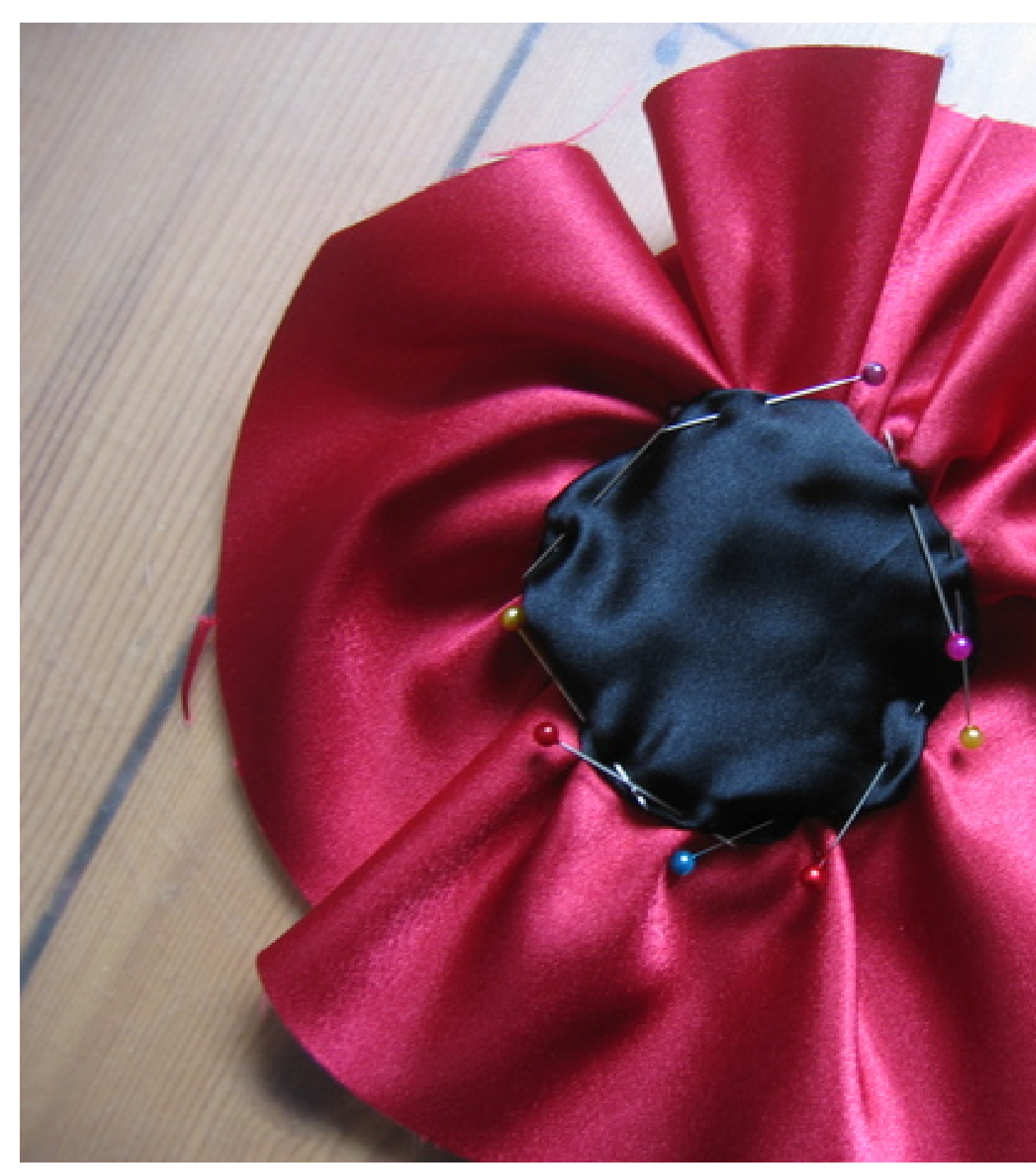
Step 6 — ... flatten and pin...