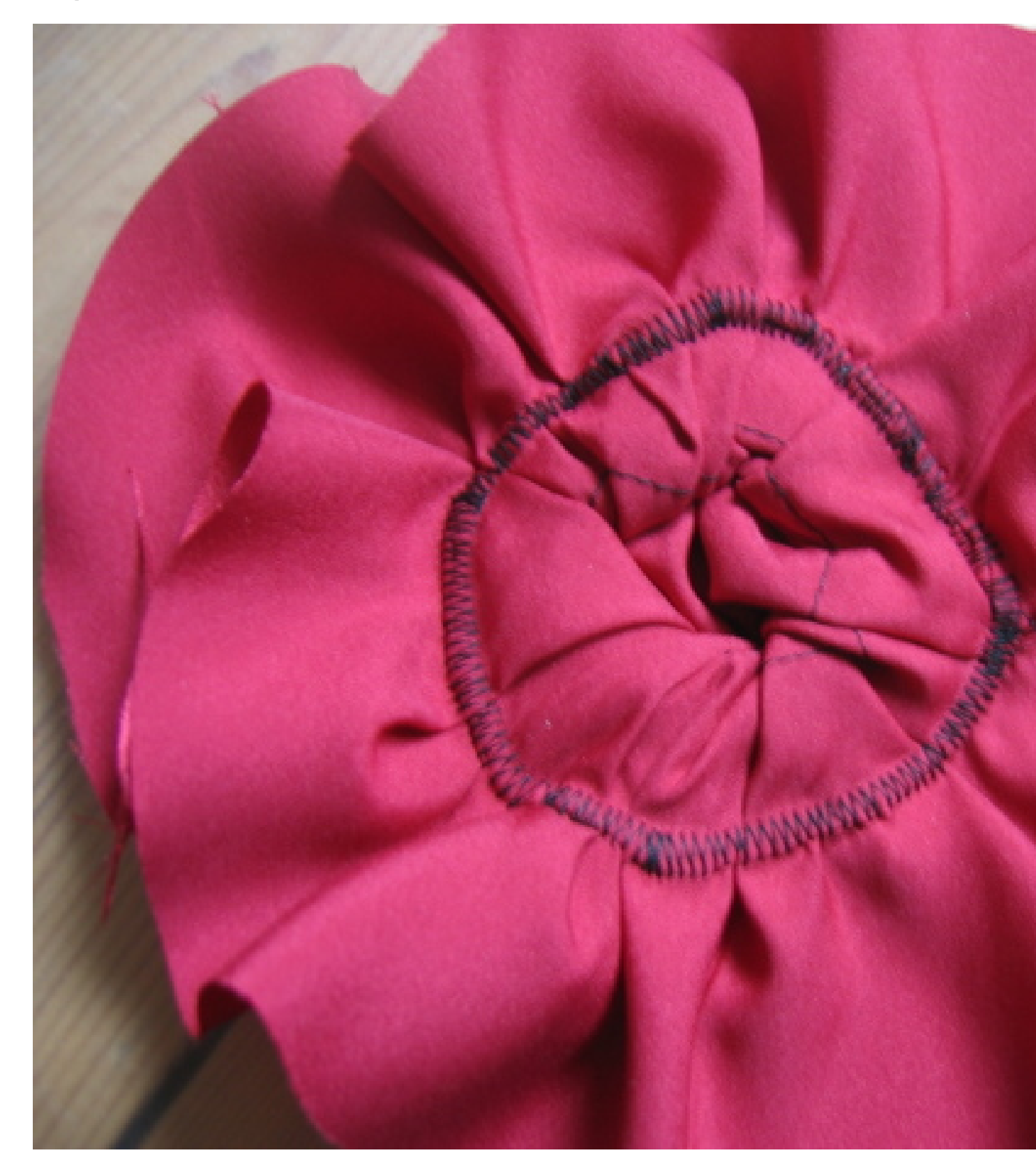
Step 8 — ...check out the back...

The back of your poppy looks like this now. You can see the first stitches and the zig-zag stitches, and the 'inverted Suffolk Puff'.