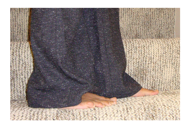
Another "Before" view.