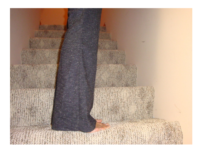
Look at my long (Before) pants.