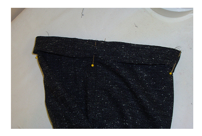
Fold the pants to the point that the hem does not show on the right side. Then match the side seam and pin close to the seams. Not on the seam so that you do not have to remove the pins while sewing in the ditch (Step 8).