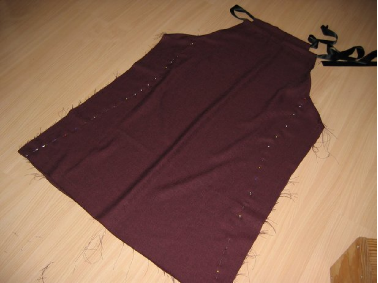
I basted the side seams and tried the dress on to see how it fits. Then I stitched and serged the side seams.