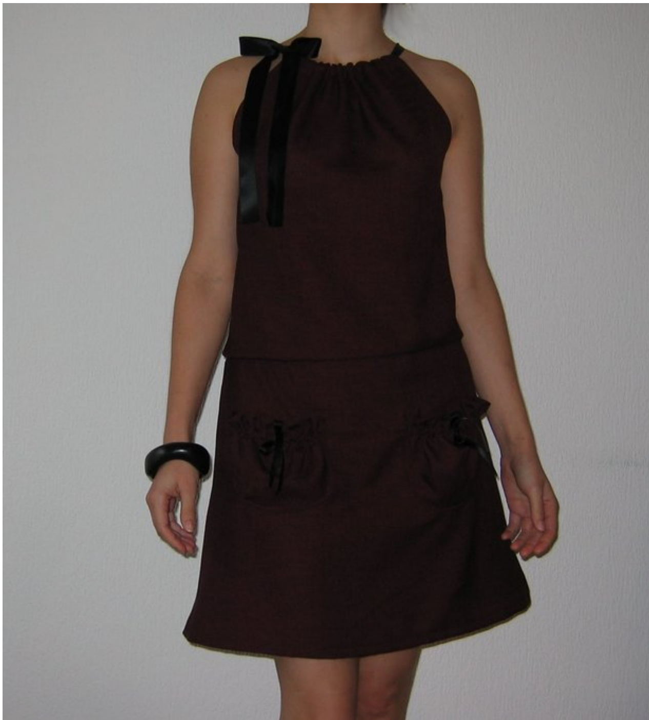
linen dress – my variation of Sidonie pattern