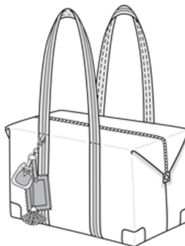
Bag Diagram, measurements in cm

Add seam and hem allowances: Seams and edges 1 cm (3/8 in).